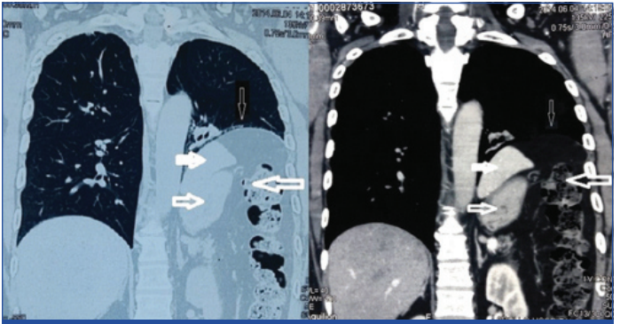
[Table/Fig-1]: Coronal section of CECT scan of chest showing stomach (single arrow), spleen (thick white arrow), splenic flexure and colon (bigger arrows) below the elevated and thin left hemidiaphragm (black arrow).

Patient responded well to medical treatment for his respiratory